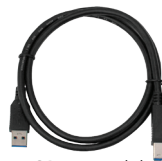
USB 3.0 cable