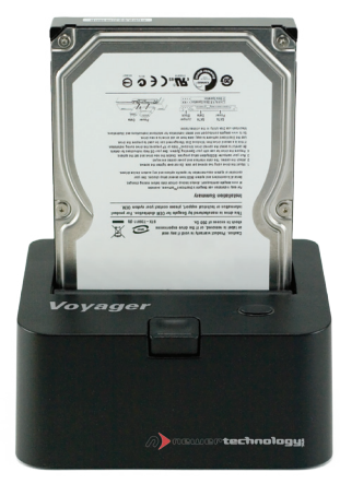
3.5" SATA Drive