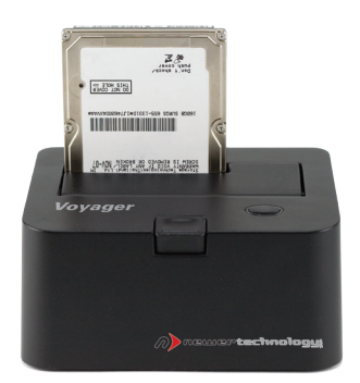
2.5" SATA Drive

3. Press the Power Button to turn Voyager on.