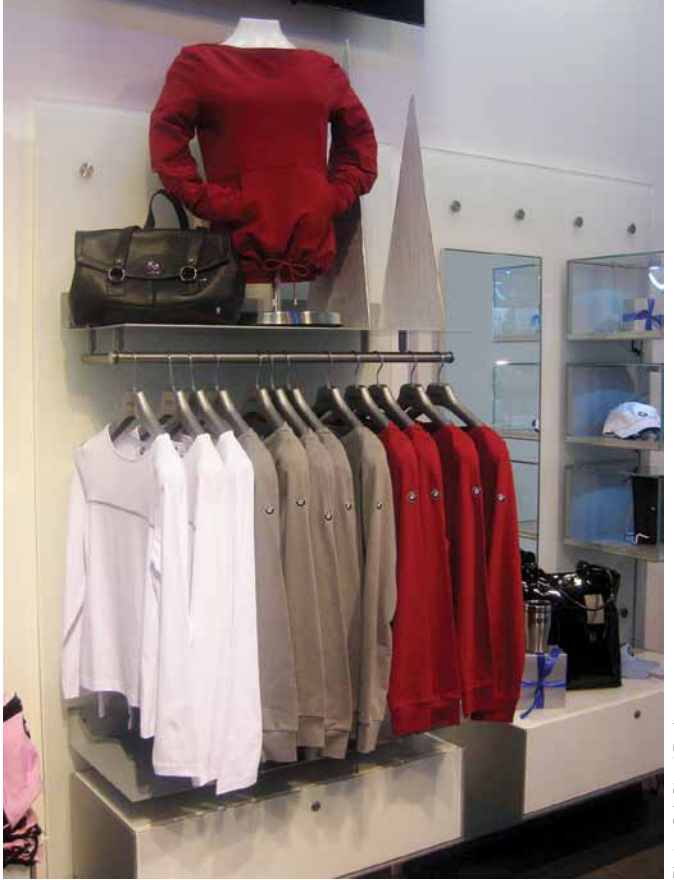
Oak Street Design