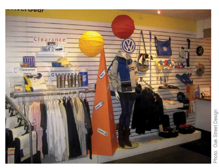
Focal Point After

The second lesson of Visual Merchandising is to hide or remove tags. In a storefront display, tags hanging in all different directions distract potential customers by diverting their attention away from the story you are trying to tell. If the window shopper can't see the price, she is more likely to come inside and inquire, giving you face time to interact and have a conversation. Combined with your dynamic people skills, the window shopper then turns into a customer. When designing a shop window, your last step should be to remove or tuck the tags in or pin them back to create nice, clean lines.