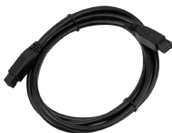
FireWire 800 (1394b) cable