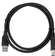
USB 3.0 (A to Standard-B) cable